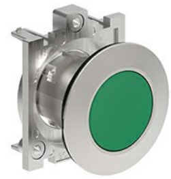
Pushbutton actuator, spring return LPFB10